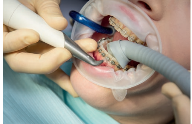
Focussed flow pattern with extremely favourable jet angle even for inaccessible areas.

The shape, diameter, length and haptics of the Supra nozzles are perfectly adapted to the requirements of the therapist. The ergonomic design allows you to work without tiring and without needing to exert too much force. The Supra nozzle is convincing with its robust, autoclavable plastic and metal material mix.