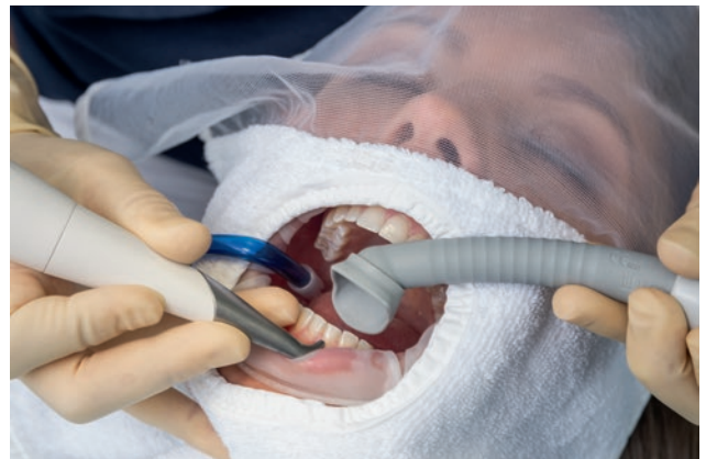
The Supra nozzle can be rotated through 360°. This means that all dental areas are easily accessible.

The nozzle opening has an ideal opening angle and focuses the powder flow precisely on a large working area.